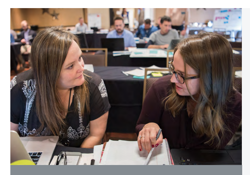
Teams from the fourth class analyze market pathways for their early stage technologies. This is just one of many hands-on activities DOE Lab-Corps participants complete with support from industry mentors and nstructors from the clean energy sector.